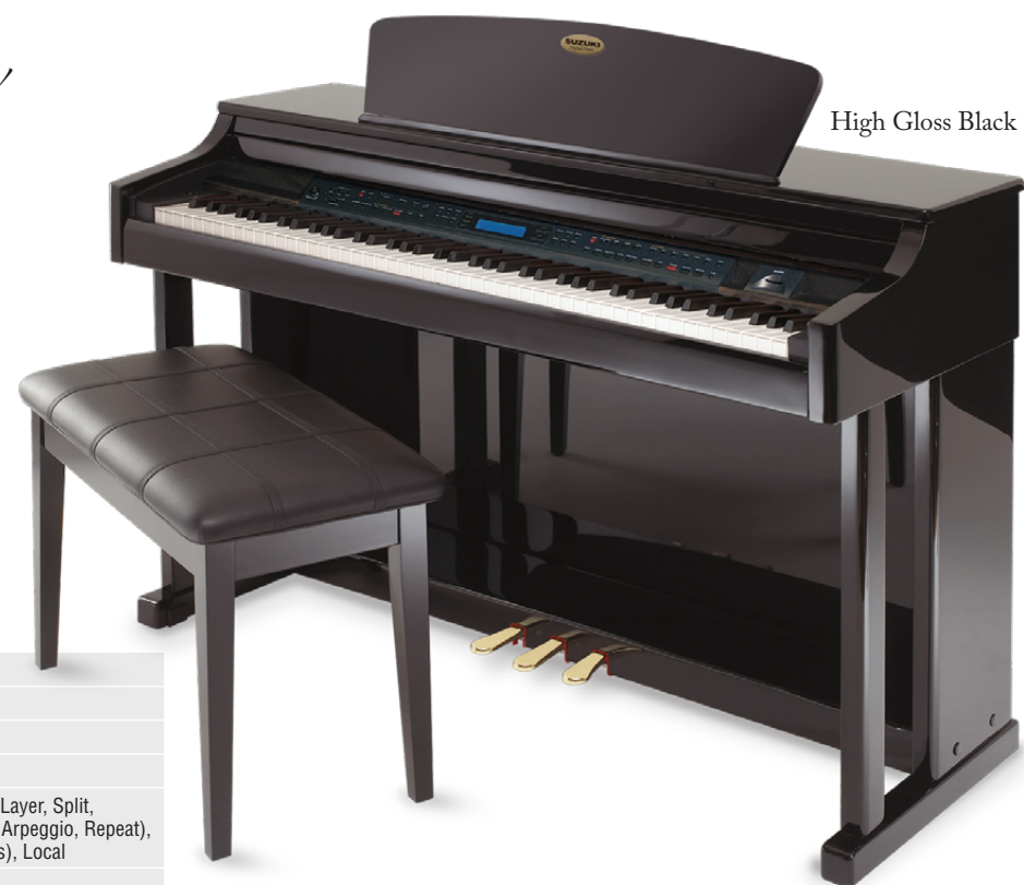
High Gloss Black